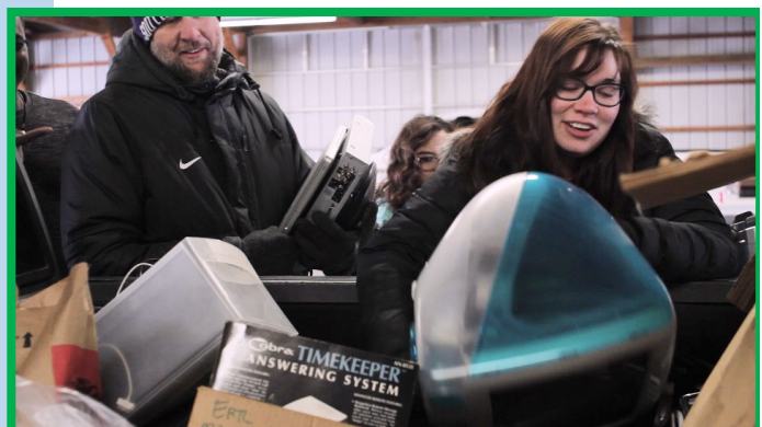
Southwestern College, KS