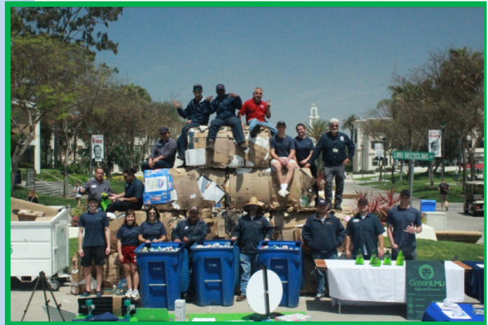
Loyola Marymount University, CA