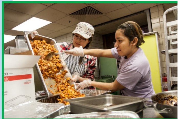
Knox College, IL